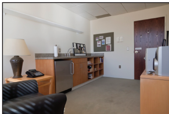
LifeCare's lactation room gives mothers a sanitary, private space to pump and store breast milk.

leave, reduces absenteeism, lowers health care claims and increases the engagement of working mothers throughout their careers by making sure they have access to high-quality breastfeeding education, support, resources and pumping facilities at work.